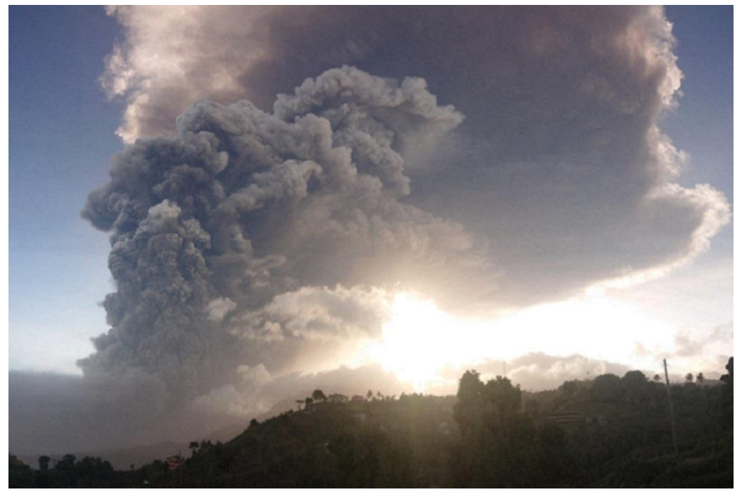
Image: Explosive Eruption at La Soufrière Volcano, St. Vincent & the Grenadines on April 13, 2021